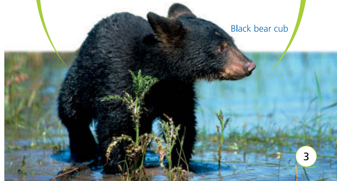
Black bear cub

Actually, the black bear lives in both places. It can be found in the northern states of the U.S., such as Minnesota, as well as in southern states, such as Florida. Florida is home to many plants and animals.