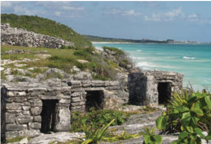
The Maya might have left their cities when water became scarce in a series of droughts.

The weather is another thing that may have hurt the Maya. Scientists have found that the years from A.D. 800 to A.D. 1000 were the driest in eight thousand years! There might have been a terrible drought, which could have dried up the Maya's water supply in the cities' reservoirs .