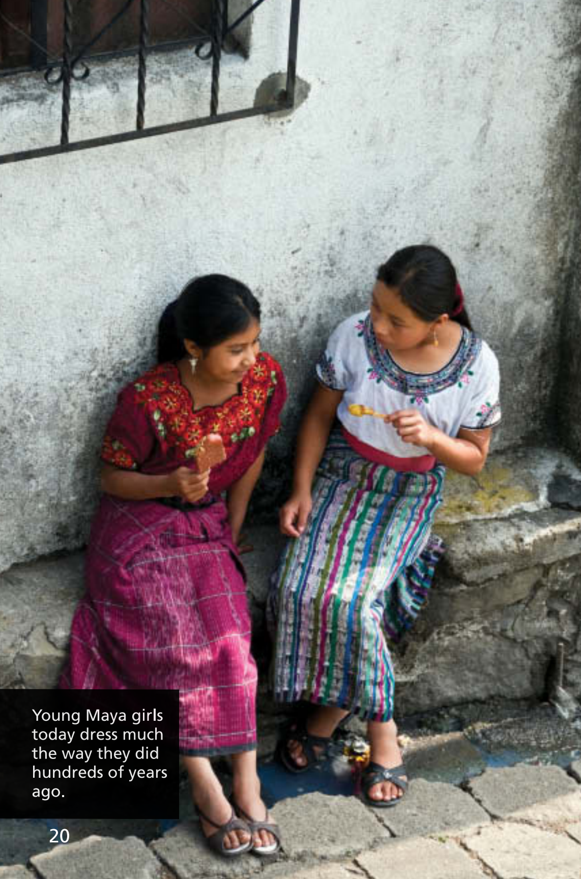
Young Maya girls today dress much the way they did hundreds of years ago.