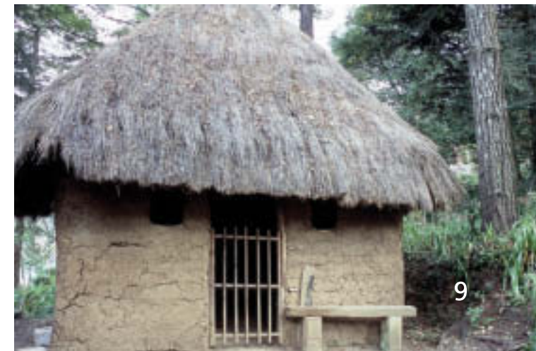
A mud-and-thatch hut in Mexico

Yet despite their magnificent temples and sophisticated farming methods, most Maya lived in small, simple houses. These were built with mud walls and thatched roofs supported by poles. A one-room house held a whole family.