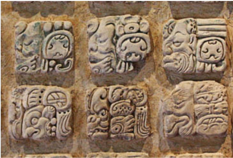
Maya writing looked like pictures, but every picture had a meaning.