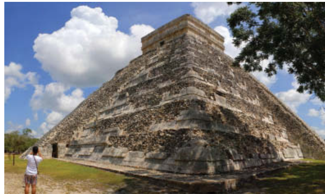
A tourist is photographing an incredible Mayan ruin.

People from all over the world are fascinated by the amazing Maya and come to visit their incredible ancient cities. Perhaps, one day, you will too!