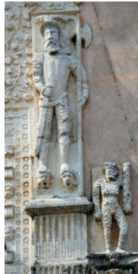
A Spanish conqueror stands on the heads of two Maya.