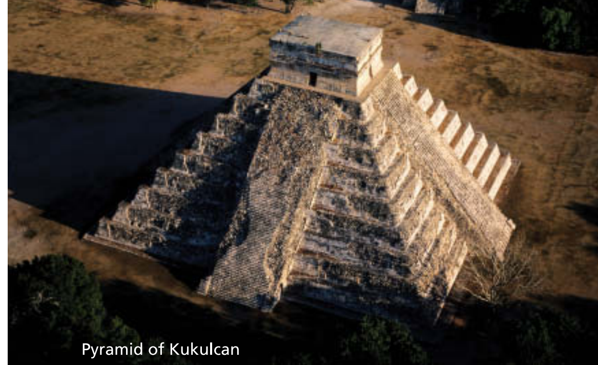
Pyramid of Kukulcan

The Maya built large structures out of limestone. The biggest of these were the temple-pyramids, which were usually situated at the center of a city. The largest rising as high as 212 feet, the pyramids were centers for the Maya religion. Traveling Maya also used these temples as landmarks, since their tops rose high above the trees.