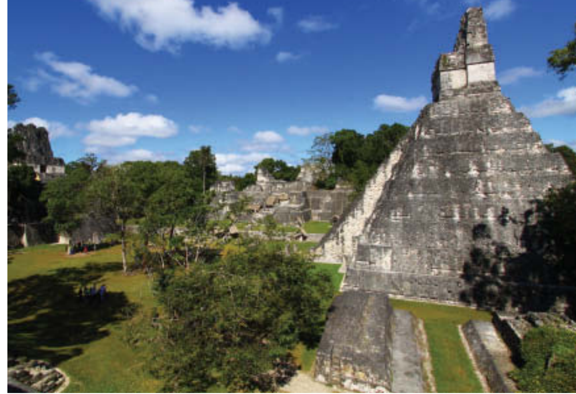
Ruins of Maya temple in Guatemala

The Maya lived in a large area ranging from Central America into southern Mexico. The area is known as Mesoamerica . Ancient Maya lands are now part of the countries of Mexico, Belize, Guatemala, El Salvador, and Honduras.